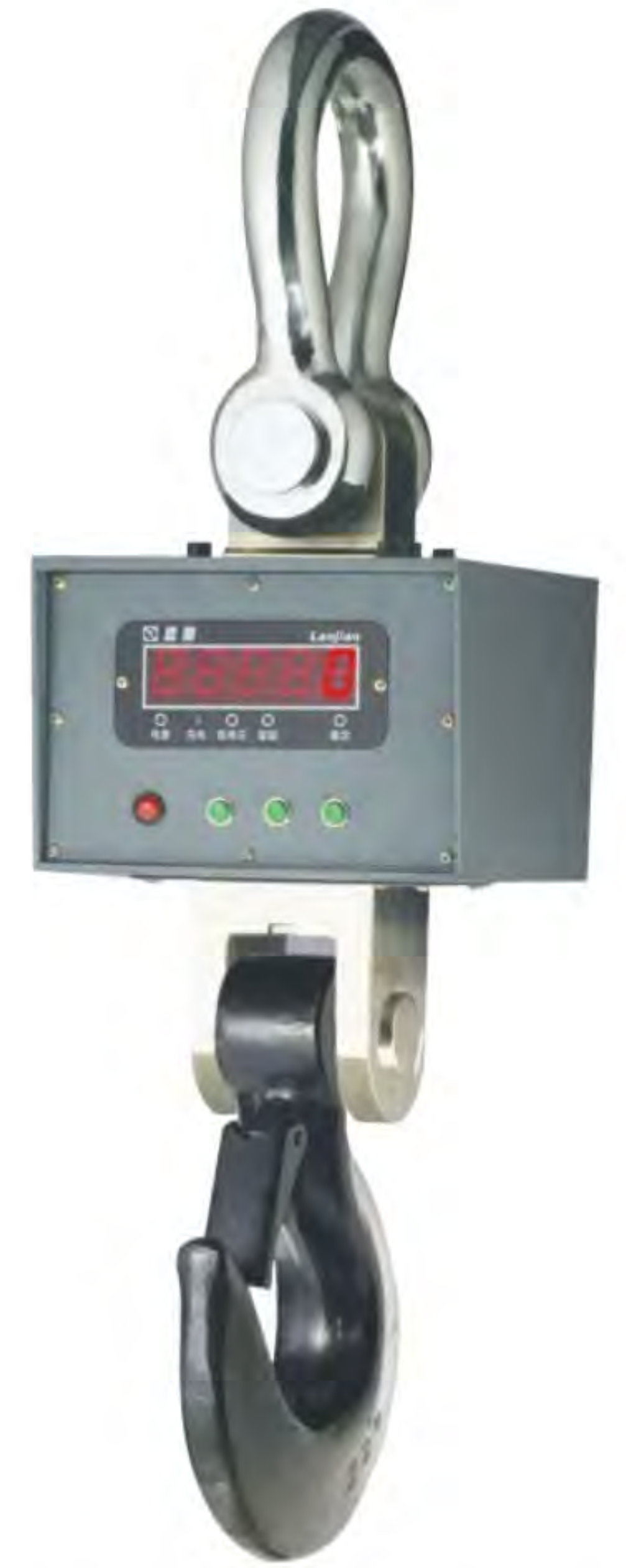
For cap : 20T-30T