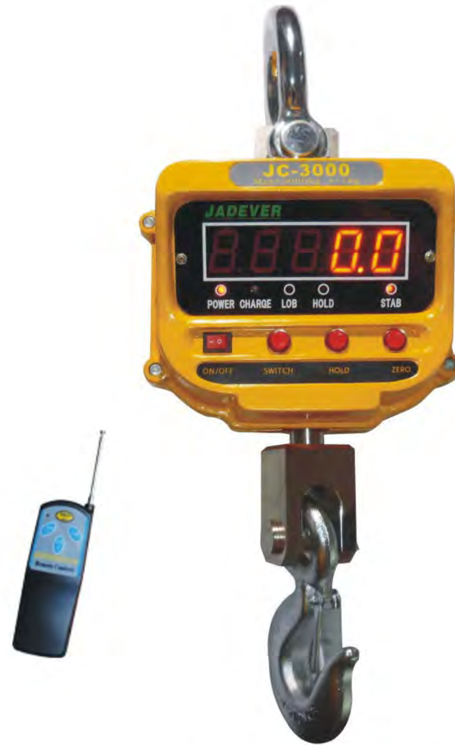
For cap : 600kg-15T